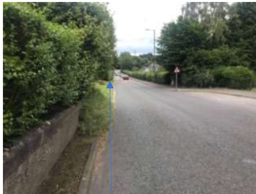
Appearance from brow of the hill. Sign obscured by hedge.