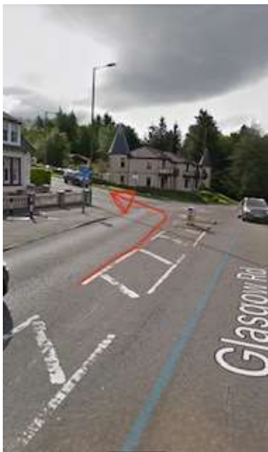
Turning Left at Kirk House

To reiterate what was mentioned earlier: