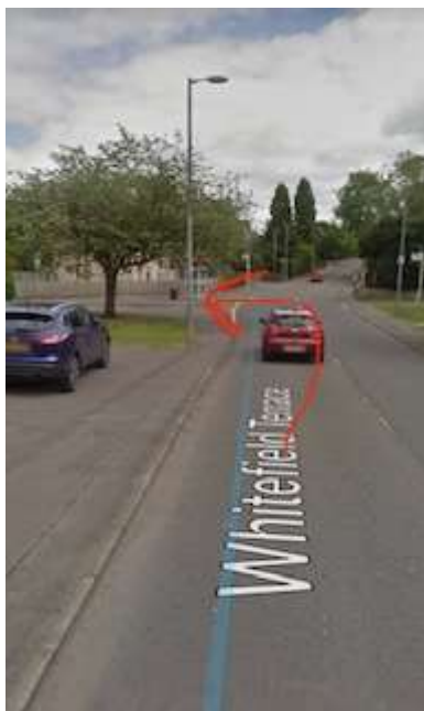
Lennox town First Turn