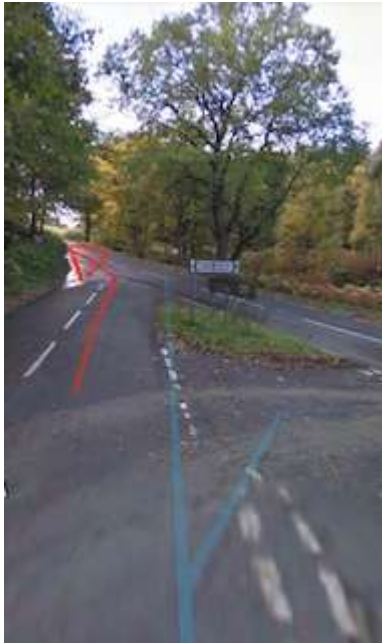
Onto Balfron to Kilearn Road