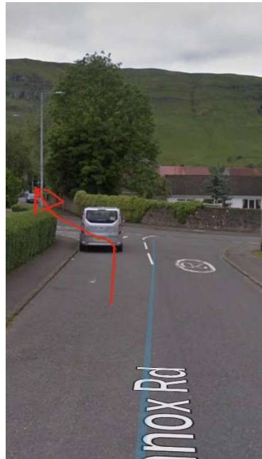
Lennox town Second Turn